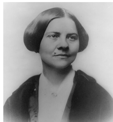
Lucy Stone