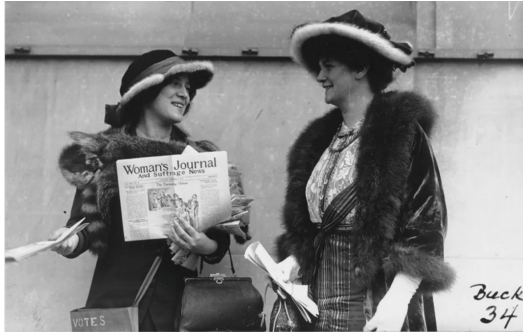
Selling copies of the Woman's Journal.

Association in New York. Both groups focused on winning the vote, but Stanton and Anthony set their sights exclusively on women's rights, including divorce laws and equal pay. Their aim was to pass a Constitutional Amendment. By contrast, AWSA included male officers, continued the fight for racial equality, and supported a grassroots approach at the state level.