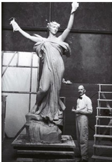
Daniel Chester French, The Spirit of Life.