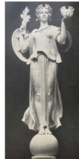
Civic Fame, Adolph Alexander Weinman.

In April 2023, the City of Columbia and the South Carolina Department of Archives and History erected a plaque in her honor at the site of her birthplace.